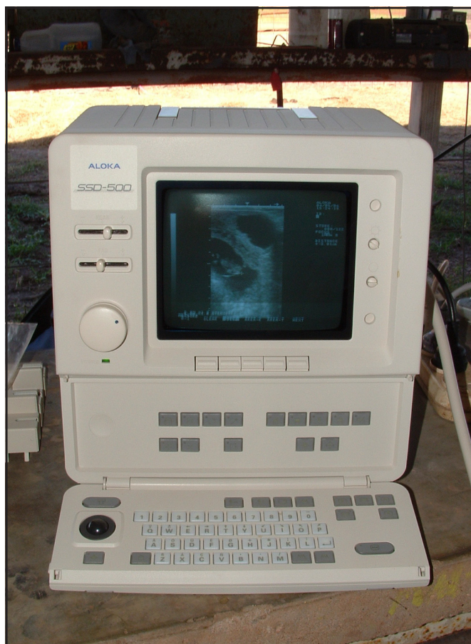
BELOW: The ultrasound machine, displaying the image of a foetus on screen.