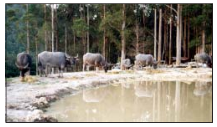
Part of the Oates' Oyster Cove Buffalo herd

Bridgewater where we collected them from."