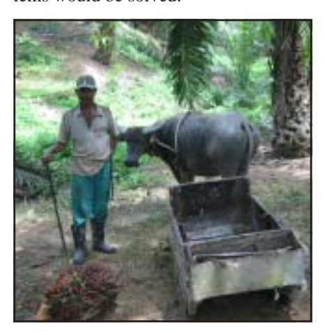
Buffalo are harnessed to sleds (above) and carts (below) for palm oil fruit haulage on Sabah plantations.

"People we spoke to did not realise that good quality Australian buffalo were so readily available. Some were concerned about the temperament of the buffalo, but if they were supplied with farmed animals, the temperament problems would be solved."