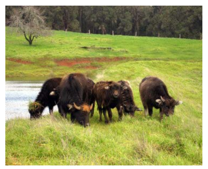
ABOVE & BOTTOM RIGHT: Some of the buffalo on Rowlands southwest property. BELOW: One buff happy to be handfed.